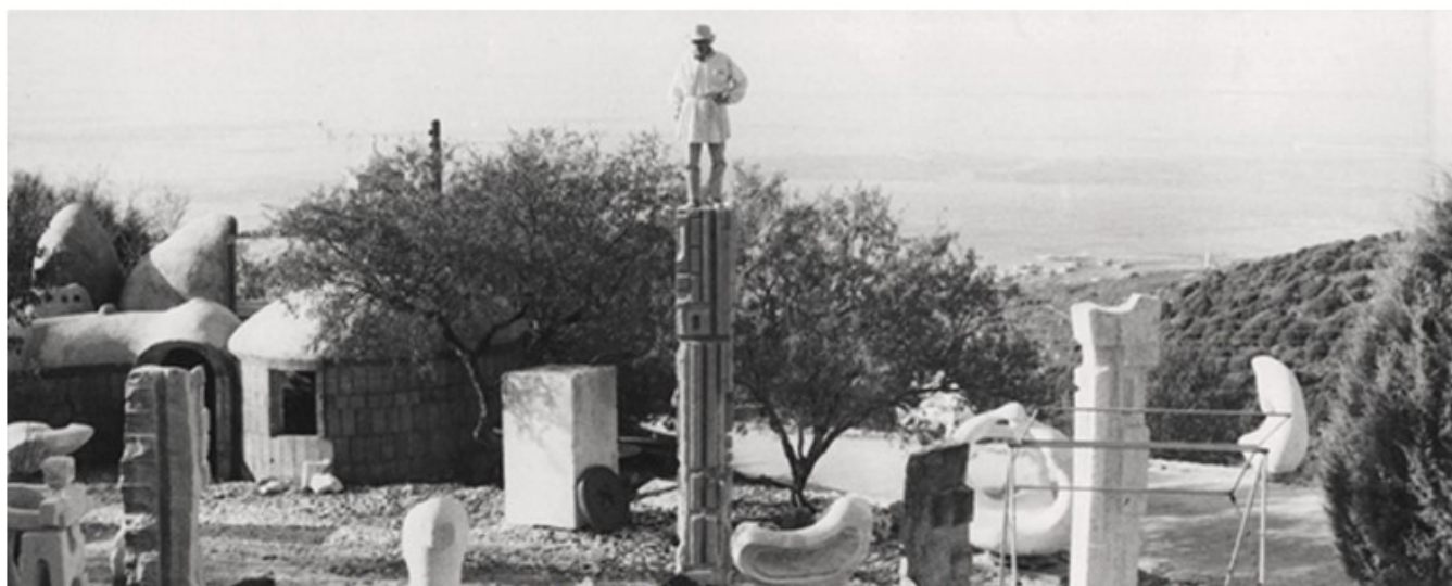
Alfred Basbous in his studio in Rachana, Lebanon in the 1970s

S culpture made a rather late entry into the canon of Middle Eastern art production. Islamic art was primarily focused on two-dimensional paper art: illustrations, miniatures, manuscripts and calligraphy. Three-dimensional art, sometimes interpreted as un-Islamic because it 'recreates' in the image of God, particularly where it references the human form, was not developed in the same way as these other art forms.