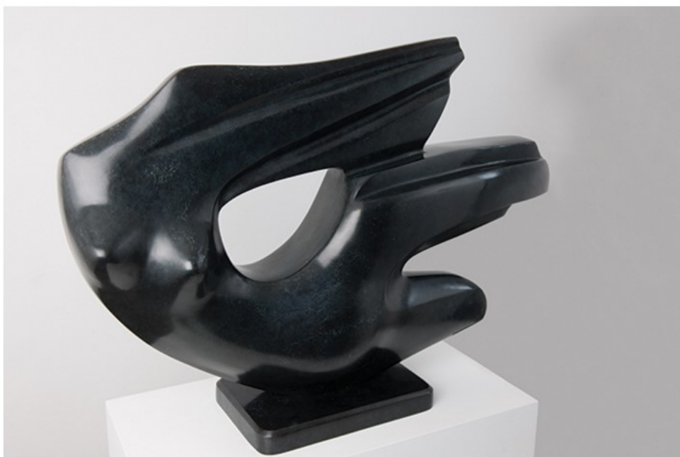
Alfred Basbous, 1985, Syrène , Bronze, 66 x 105 x 30 cm

Sophia Contemporary Gallery has just revealed a survey of the work of Alfred Basbous, a major pioneer of Modernist sculpture. Influenced by Jean Arp, Brancusi, and Henry Moore, Basbous created stone and bronze sculptures of often monumental proportions. The series of sculptures in the current show date from the 70s to the 2000s, which demonstrate Basbous's exploration of the relationship between form and material. A selection of preparatory drawings complement the show meaningfully, as it is always most revealing to understand the artist's process.