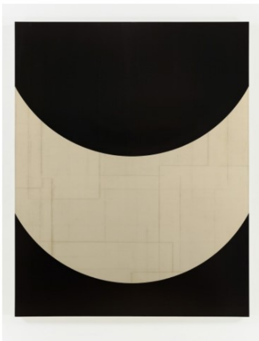
Robert Kelly Mimesis CV , 2008 Sophia Contemporary

Unlike the work of some artists who deal in abstraction, Robert Kelly’s meticulous compositions are deeply rooted in the stuff of the real world. The formidable paintings—“formal puzzles,” he has called them—mix line and color with vague remnants of text. In “Black on Bone,” a selection of his commanding work is now on display at Sophia Contemporary, marking the American artist’s first London solo show.