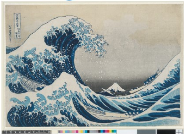
Hokusai: beyond the Great Wave British Museum, Great Russell St, Bloomsbury, London WC1B 3DG May 25 to August 13 (closed July 3 - 7, for