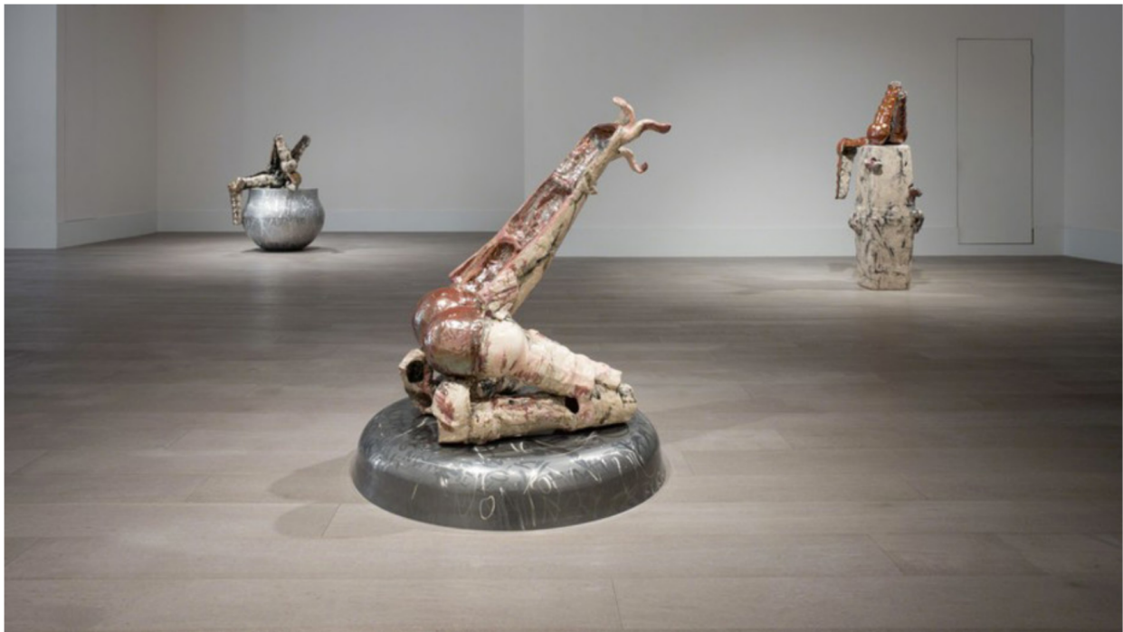
Veronica Brovall.

Sophia Contemporary is pleased to announce Wear the Heat , the first solo exhibition of Swedish artist Veronica Brovall in the UK. The exhibition will feature seven new glazed ceramic and steel sculptures created in 2018. Wear the Heat will open to the public with a reception from 6-8PM on Tuesday, June 26, and will remain on view through July 28, 2018. The exhibition will be accompanied by a fully illustrated catalogue with a foreword written by Natasha Morris.