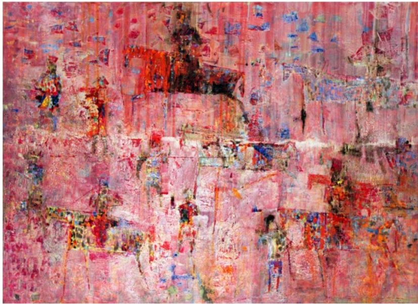
Reza Derakshani, Hunting the Ecstasy, Courtesy of the artist and Sophia Contemporary Gallery