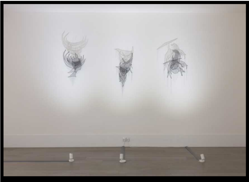
Installation view Afruz Amighi's 'Echo's Chamber' at Sophia Contemporary Gallery, London

COURTESY: ARTIST AND SOPHIA CONTEMPORARY GALLERY