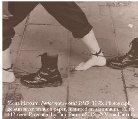
Mona Hatoum. Performance Still 1985, 1995 . Photograph, gelatin silver print on paper, mounted on aluminium. 76.4 x 113.6cm. Presented by Tate Patrons 2012. © Mona Hatoum.

2016 will mark the first London-based survey of work by Lebanese-born Palestinian artist Mona Hatoum at Tate Modern from 4 May–21 August 2016. The exhibition will include over 100 works, from performance to works on paper spanning 35 years of practice that captures Hatoum's political and aesthetic concerns.