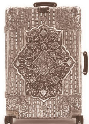
Wim Delvoye. Rimowa Classic Flight Multiwheel 971.63.00.4. 2014. Embossed Aluminium. 71 x 47 x 25.5 cm.