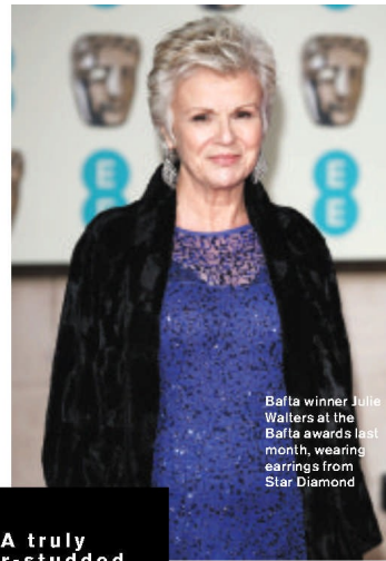
Bafta winner Julie Walters at the Bafta awards last month, wearing earrings from Star Diamond

The fashion pack was in town last month for London Fashion Week, with many events, catwalk shows and presentations taking place in Mayfair. Julien Macdonald showcased his autumn/winter 16 collection (left) at One Mayfair in North Audley Street. And, while Burberry showed its womenswear February 2016 Collection over at Kensington Gardens – accompanied by a live performance by musician Jake Bugg – audiences at the Regent Street store were given the opportunity to view, pre-order and personalise pieces shown on the runway.