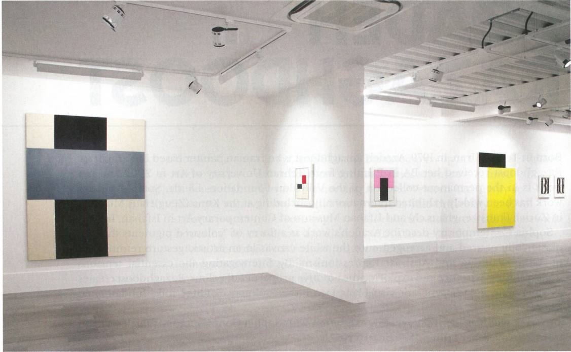
Installation view of Robert Kelly, Black On Bone , Selected Works at Sophia Contemporary Gallery.

York ( bronxmuseum.org ), and even the Musée Guimet in Paris ( guimet.fr ).