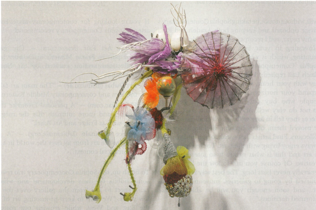
“Under the Wandering Reach” by Rina Banerjee