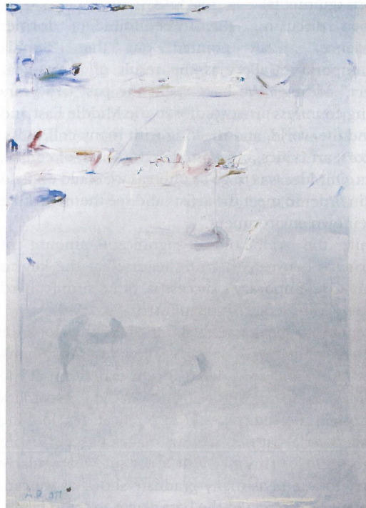
"Dear Theo" by Azadeh Razaghdoost