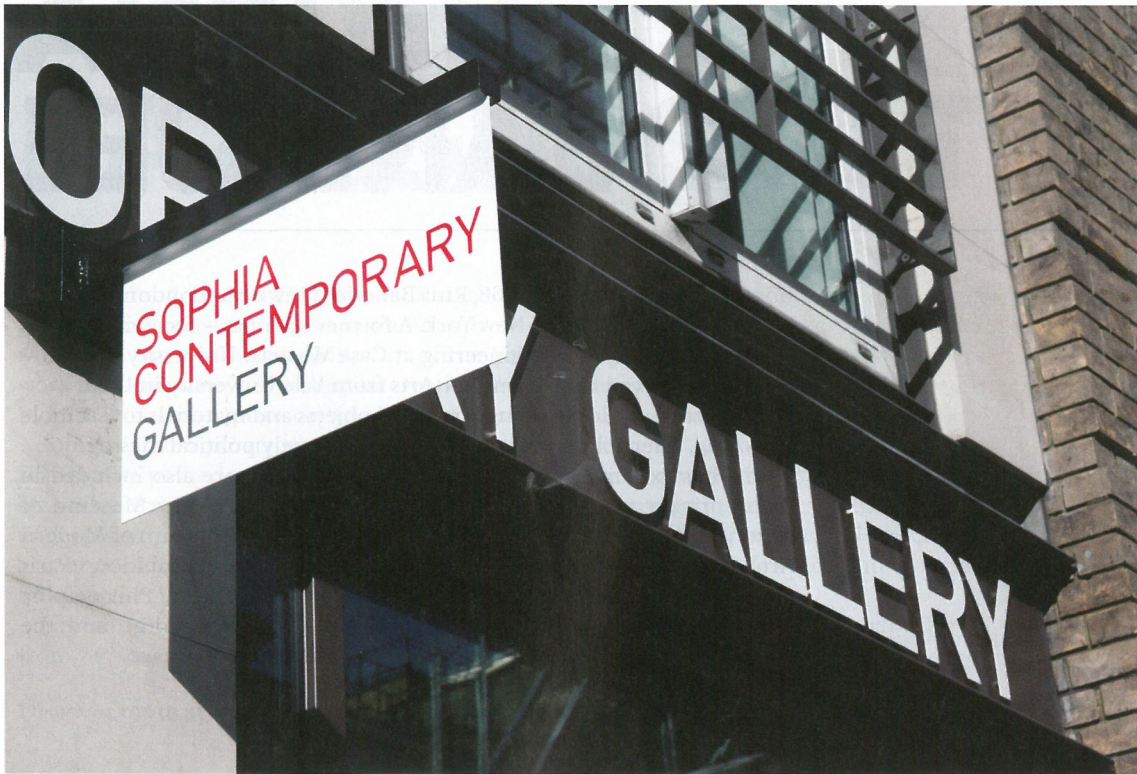
Sophia Contemporary Gallery, Exterior.