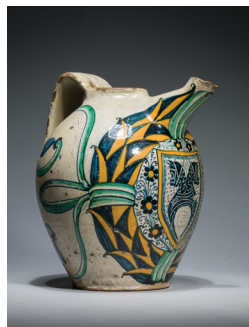
MONUMENTAL SPOUTED JUG 1480-1490

Find narrative vessels at Sam Fogg from the quattrocento – a time when bright white earthenware began to be decorated with expressive designs. Maiolica before Raphael, until 16 June, 15d Clifford Street, W1S, samfogg.com