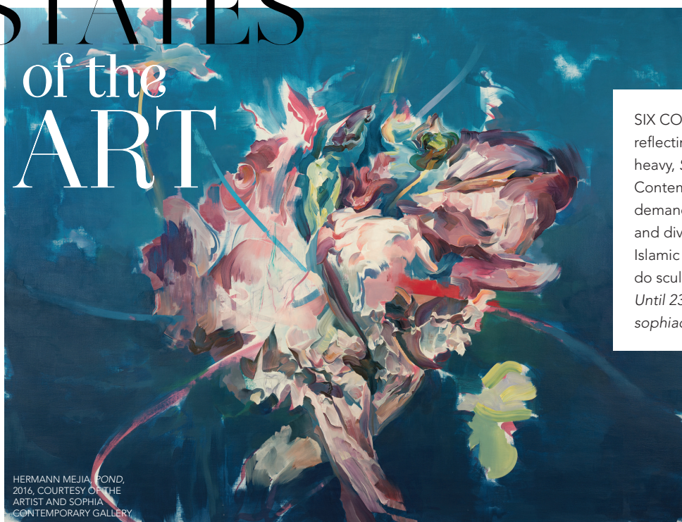
HERMANN MEJIA, POND, 2016, COURTESY OF THE ARTIST AND SOPHIA CONTEMPORARY GALLERY

SIX CONTEMPORARY American artists reflecting on American art: while it sounds heavy, Shifting Landscapes at Sophia Contemporary is a visual feast that demands a return visit. Abstraction, culture and diversity all play their part (from Islamic mosques to Gothic churches), as do sculpture and hand-cut paper screens. Until 23 June, 11 Grosvenor Street, W1K, sophiacontemporary.com