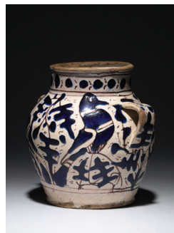
SMALL STORAGE JAR WITH ADDORSED BIRDS c. 1420-1440