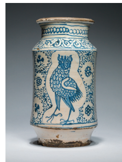
LARGE ALBARELLO WITH AN OWL AND A STORK c. 1430-1450