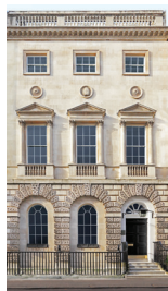
ELY HOUSE, 37 DOVER STREET, COURTESY OF GALERIE THADDAEUS ROPAC LONDON · PARIS · SALZBURG

The gallerist opened doors on Dover Street last month