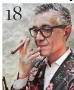
COVER: REZA DERAKSHANI, COURTESY OF REZA DERAKSHANI AND THE BOPMA CONTEMPORARY GALLERY