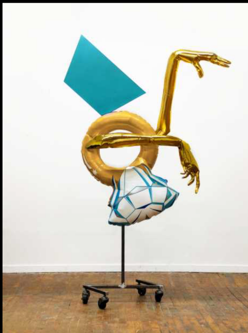
"Mountains of Ice," 2018