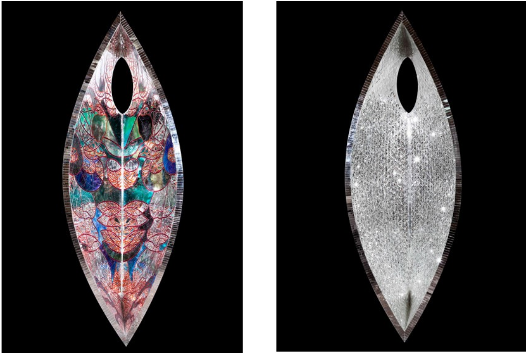
Left: Pooya Aryanpour – Temptation, 2015 – Part 1 / Right: Pooya Aryanpour – Temptation, 2015 – Part 2

There is a secret idea hidden within the artworks of the popular Iranian artist Pooya Aryanpour , as he claims himself, and the audience will get the chance to reveal its meaning at the upcoming exhibition at Sophia Contemporary Gallery in London. As the first Aryanpour's solo show in the UK, this will be a unique opportunity for viewers to discover the enigmatic delicacy of richly textured surfaces with abstract shapes and intense colors. The exhibition will include a wide range of his well-known mirror sculptures accompanied with new paintings from the Under the Shell series.