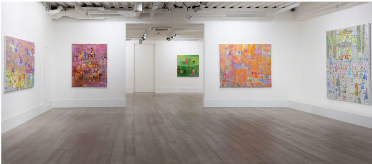
Reza Derakshani.

Sophia Contemporary is proud to present 'Hunting the Light', the gallery's second presentation of paintings by the Iranian-American artist Reza Derakshani. Following Sophia's successful inaugural exhibition of his work in 2016, 'Hunting the Light' features twelve new paintings demonstrating Derakshani's continued quest for a visual language that bridges Iranian artistic traditions with Western contemporary and abstract inclinations. On view from January 26 through March 10, 2018, the exhibition includes new works from three of Derakshani's ongoing series: 'Hunting,' 'Garden Party,' and 'Shirin and Khosrow.' The new paintings in the series continue in the trademark vivid and expressive style of Derakshani's earlier works, and are executed in oil on canvas.